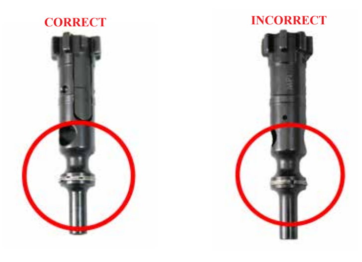
Correctly Staggered Gas Rings