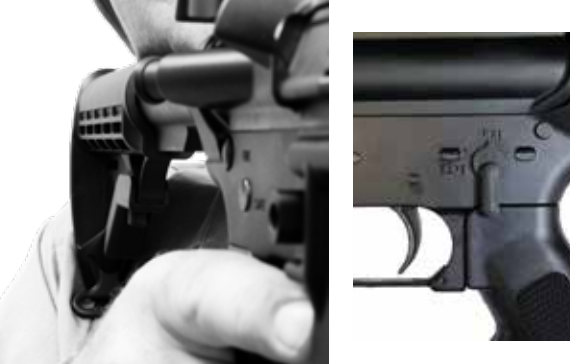
SAFETY & OPERATING MANUAL

Use both hands to bring the firearm up to a level position and firmly seat the buttstock to your shoulder high enough so that you do not have to crane your head over too far to see your sights.