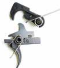
AR-15 Milspec Trigger