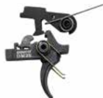
DM2S® 2-Stage Trigger