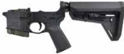
BRAVO ZULU™ Built Lower Receiver - CA With DFM® Mag