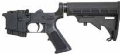
M4 Built Lower Receiver - CA With DFM® Mag