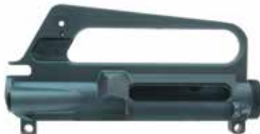
A1 Stripped XM15® GREY Upper Receiver