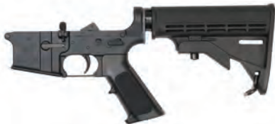
M4 Built Lower Receiver