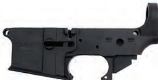
XM15-E2S® Stripped Lower Receiver