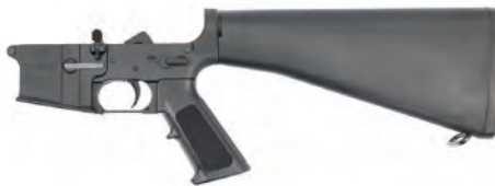
A2 Built Lower Receiver