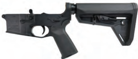
Bushmaster® Bravo Zulu™ Built Lower Receiver