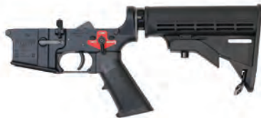
BFSIII® M4 Built Lower Receiver