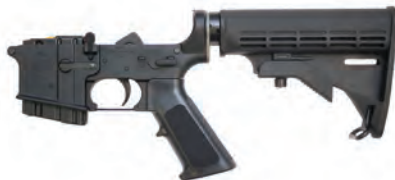
M4 Built Lower Receiver - CA With DFM Mag