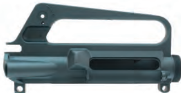
A1 Stripped XM15 ® GREY Upper Receiver